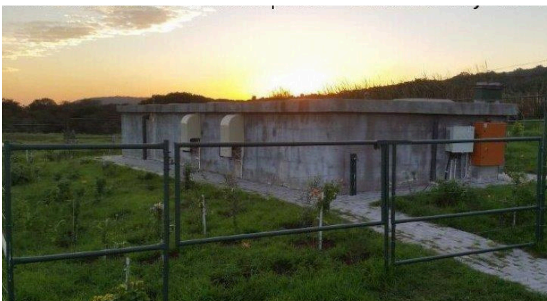
70kl concrete effluent treatment plant -Sardinia Bay, South Africa