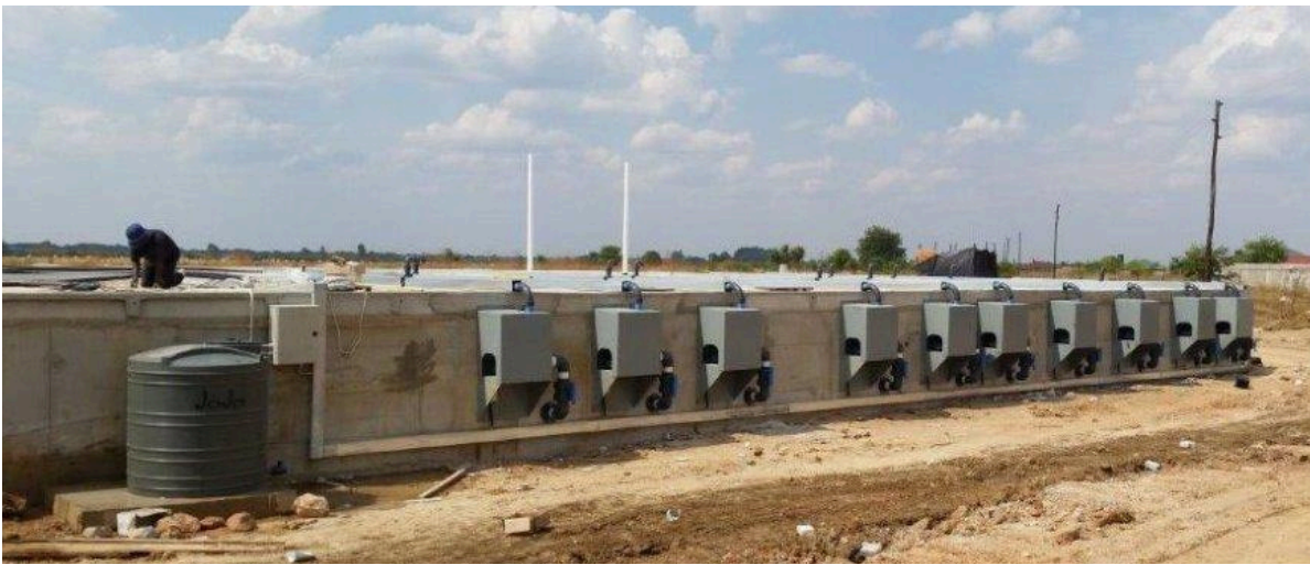
500kl concrete effluent treatment plant - Lusaka, Zambia