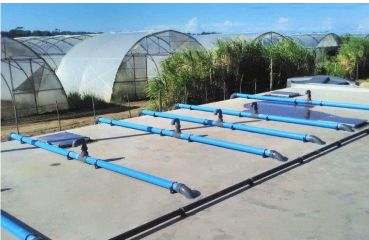
70kl concrete effluent treatment plant -Sardinia Bay, South Africa